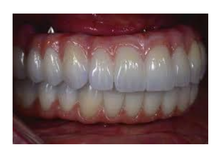
Option selcted: .....

Additional 6500.00 dollars per arch for Stunning Zirconia.